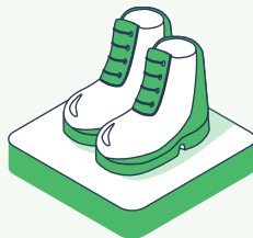
Leather safety boots (or high boots) with a rigid metallic/composite impact-resistant toe box (cold-proof boots in winter)