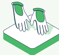
Polymer-coated knitted gloves